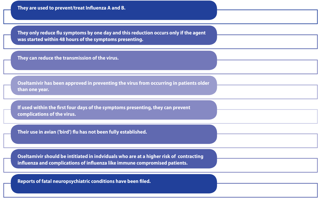
Figure 3. Important information regarding the use of oseltamivir and zanamivir<sup>1,18</sup>

Amantadine is an antiviral drug that is commonly associated with the treatment of Parkinson's disease. It is however also used in the prevention and treatment of influenza A. Amantadine acts by increasing the amount of dopamine from the nigrostriatal pathway and inhibits the reuptake of dopamine by the neurons. Amantadine is currently not recommended for treatment or use as an antiviral agent as there is wide-spread resistance to the drug.<sup>1,13,18</sup>