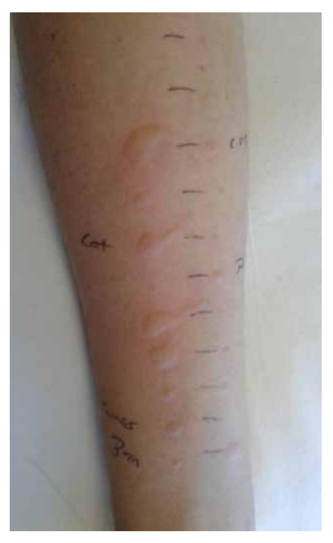
Skin prick testing for IgE mediated allergy

When urticaria is the dominant symptom, or occurs together with angioedema, the process is usually mast cell mediated. Mast cells contain cytoplasmic granules holding pre-formed substances such as histamine and proteases, release of which causes intense itching, burning, vasodilatation and recruitment of other inflammatory mediators. Mast cell activation is complex and initiated by many signals, including