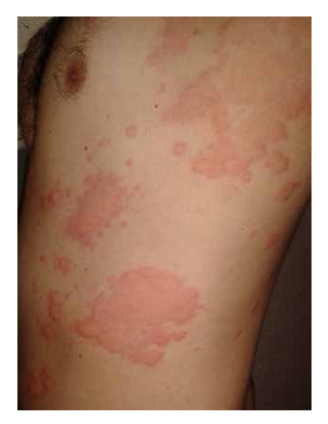
Typical urticarial skin rash

and increased vascular permeability, following release of mediators by cutaneous mast cells. 1-4 Individual urticarial lesions usually resolve within 24 hours, without scarring, as the epidermis is not involved.<sup>5</sup> The rash is intensely pruritic and tends to 'migrate' or become confluent.