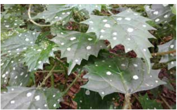
Urticaceae species stinging nettle plant

nettle plants. The classic 'wheal and flare' histamine response is illustrated by the discomfort experienced upon cutaneous contact with these plants. The polymorphic, raised and erythematous lesions of urticaria are due to vasodilation