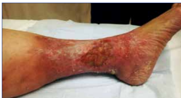
Photo by family before hospitalisation. Visible hyperpigmentation, inflammation and inverted champagne bottle shaped legs

A 79-year-old female was admitted to hospital. The patient had venous ulcers on the medial and lateral malleoli of the left lower leg for at least 6 years. She had severe oedema of her left leg. There was no history of chronic illnesses or diabetes, but there was an allergy to silver. A medical provider asked her not to expect treatment, if she was not prepared to wear compression bandages. According to the patient any tight bandage and/or stocking caused excruciating pain in the leg.