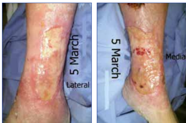
Photos taken in hospital: Slough on wound areas, with excessive serous exudate through the bandages

travel from her hometown to the consulted wound clinician at least twice a week for wound care.